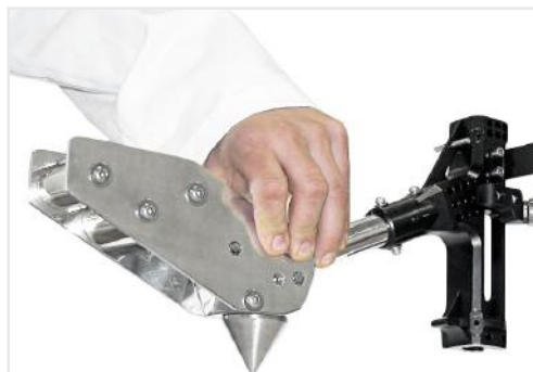
Center of gravity aligned with the penetrator tip when installed on Cadex carriage

Technicians simply have to interchange the headforms with the penetrator device in order to prepare the penetration test