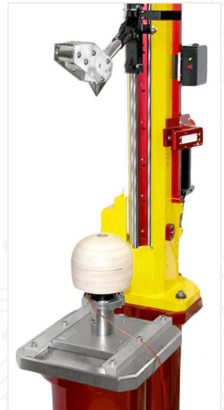
Shown on a Cadex monorail